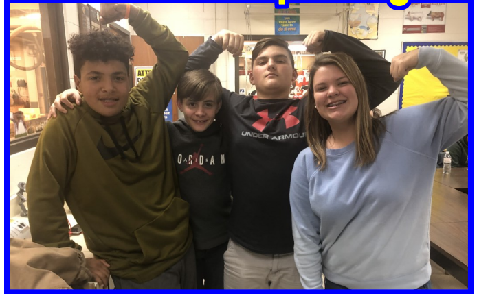
On November 14th, members of the Peebles FFA chapter attended the Georgetown Leadership Night. At the